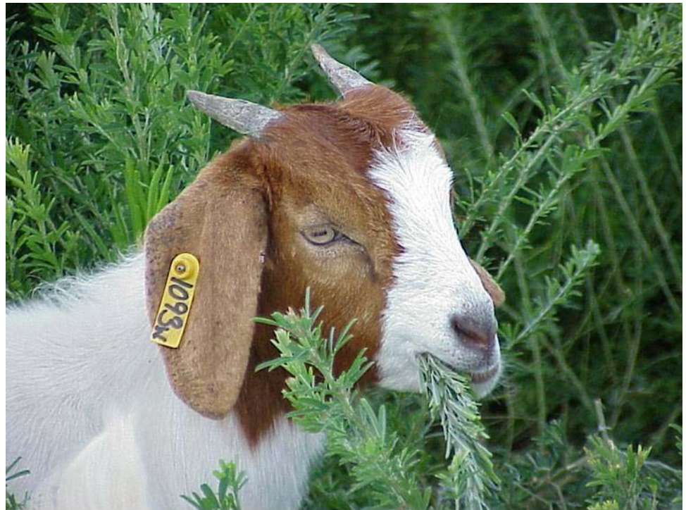
Fig. 7. A goat forages on sericea.

Farmers should not use sericea as their only method for controlling internal parasites but combine it with other methods.