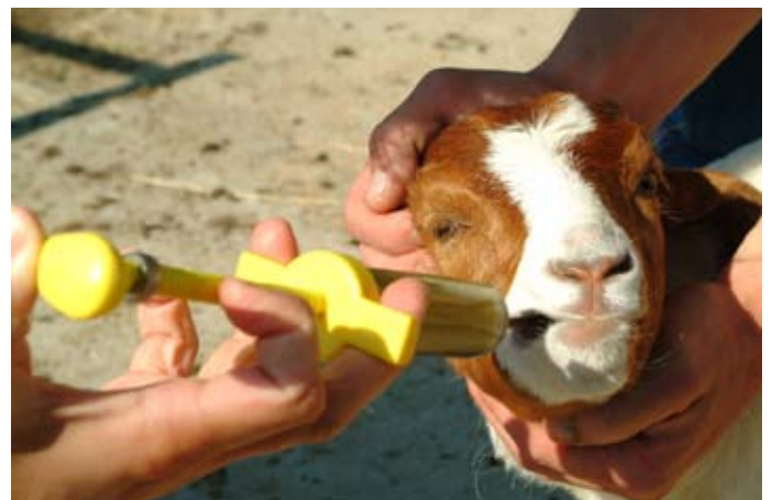
Fig. 3. Dewormers can be administered with a drench gun.