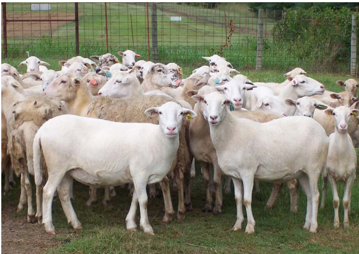
Fig. 8. St. Croix and Katahdin sheep are breeds known to be resistant to infection by internal parasites.

Internal parasites are the top health concern for sheep and goats. The long-term solution is the selection of resistant animals. Sheep breeds that have demonstrated some level of resistance to internal parasite infection include St. Croix, Barbados Blackbelly, Gulf Coast or Florida Native, and Katahdin. Less is known about resistant goat breeds, though preliminary research indicates Spanish, Kiko and Myotonic breeds may offer some genetic resistance to parasite infections.