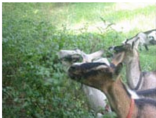
Fig. 4. Goats browsing shrubs.

Many other pasture management techniques can be used to reduce parasite problems. For more information on the Smart Drenching system see http://scsrpc.org/SCSRPC/Files/Files/Misc/DRENHIN.PDF .