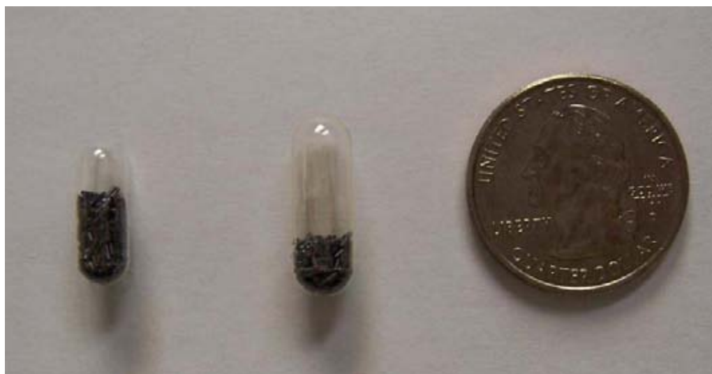
Fig. 6. Gelatin capsules, Size 3 and Size 1, filled with 0.5 g (500 mg) of COWP.

As a rule of thumb, sheep may suffer toxicity at levels above 25 ppm copper in the diet; but the interactions of other minerals will influence this. Goats, on the other hand, require copper levels ranging from 15 to 25 ppm, depending on the class of goat. In addition, goats can safely have access to a free-choice loose mineral containing 1,000 ppm copper. For more information on using COWP, see Tools for Managing Internal Parasites in Small Ruminants: Copper Wire Particles ( http://attra.ncat.org/attra-pub/copper_wire.html ).