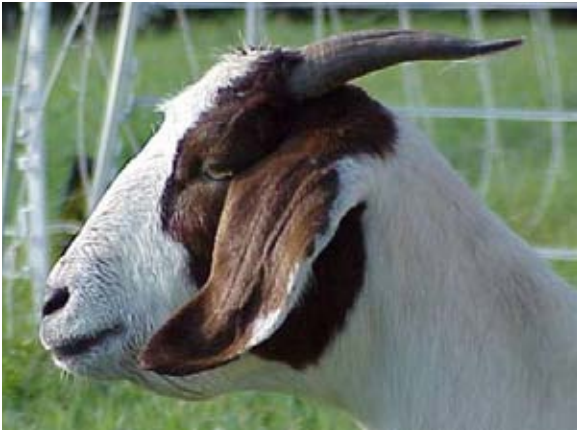
Fig. 1. Bottle jaw is a sign of heavy parasitism.