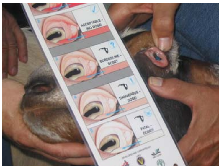
Fig. 5. The animal's inner eyelid is compared with the FAMACHA® color chart to assess level of anemia.

FAMACHA® uses a color chart that shows five consecutive grades of goat or sheep eyelid pallor, ranging from 1 (red color; not anemic) to 5 (very pale; anemic). The eyelid is compared with the chart and the animal is scored. Only animals in the palest categories are treated with dewormers. This color-coding system was 92 percent accurate in assessing anemia levels in small ruminants.