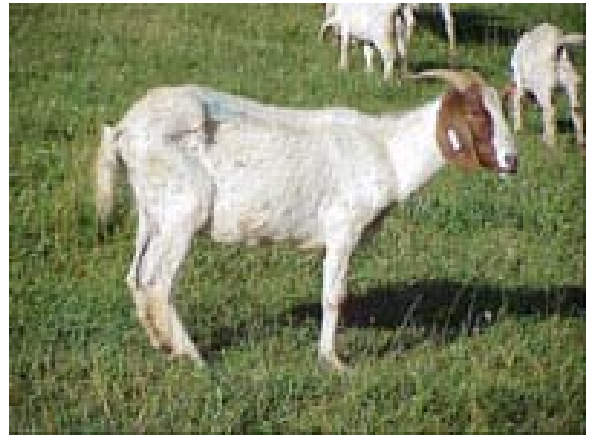
Fig. 2. This goat illustrates loss of condition and a rough coat—both signs of heavy parasitism.