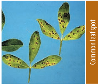
Common leaf spot

The combination of disease control, the possibility of 'plant health' promotion or enhancement, and increasing alfalfa hay prices has resulted in a lot of interest in spraying fungicide on alfalfa for dairy production systems. However, little was known about the utility or the economics of this practice. Therefore, research trials were conducted from 2011-2014 in Wisconsin to evaluate the practice of spraying fungicide on alfalfa in a 30-day cutting system.