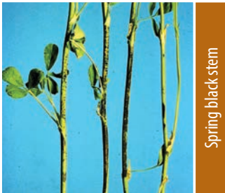
Spring black stem