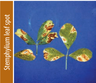
Stemphylium leaf spot

Typically in a 30-day cutting interval, like that used in dairy production in Wisconsin, foliar diseases cause minimal damage. Coupled with the heightened risk of fungicide resistance development toward these modern fungicides, application of fungicide on alfalfa for dairy production is not recommended unless heavy disease pressure is observed.