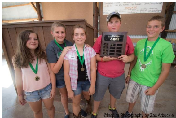
Anything Goes 1 st Place Team – Sherman Workers

Congratulations to the winning teams of the 2016 4-H Anything Goes ! 1 st place was awarded to a team from Sherman Workers, and 2 nd place went to a mixed team from Hardworking Hands, Johnsonville Hustlers, and Willing Workers. Rounding out the top three was a team from Clover Crusaders. Thank you to all of the participating teams for such a fun event!