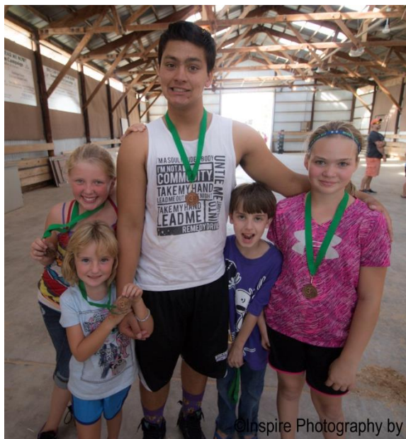
Anything Goes 3rd Place Team – Clover Crusaders