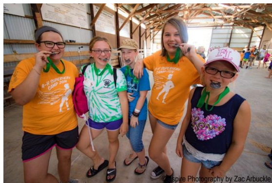
Anything Goes 2nd Place Team – Hardworking Hands, Johnsonville Hustlers, Willing Workers