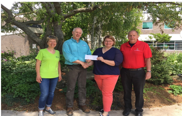
Accepting a check from Alliant Energy that will help with Ash tree removal on the UW-GB Sheboygan Campus