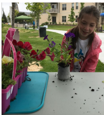
Future Master Gardener planting her own, personal, make-and-take teacup garden. We brought enough supplies for 24 containers; we could easily have served another 24 customers. Live and learn...

However, as you can see from all the huge smiles in the photos, our Sheboygan County Master Gardeners had a great day with the kids and families who braved the elements to visit us on the city green. The kids created make-and-take teacup gardens from repurposed yogurt containers and assorted petunias.