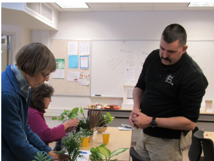
Creating a dish garden at the Recognition Meeting