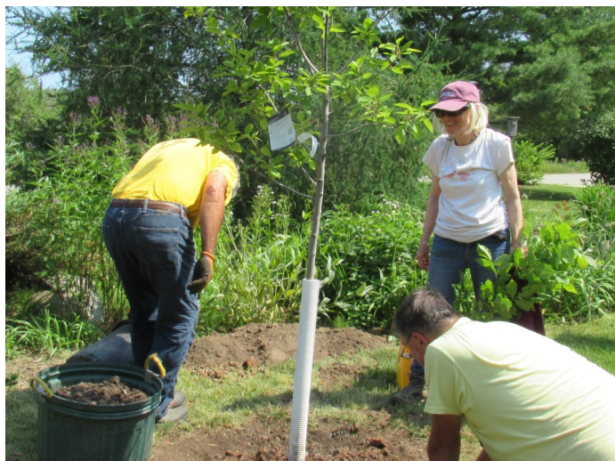
Planting trees at Kohler Andrae State Park