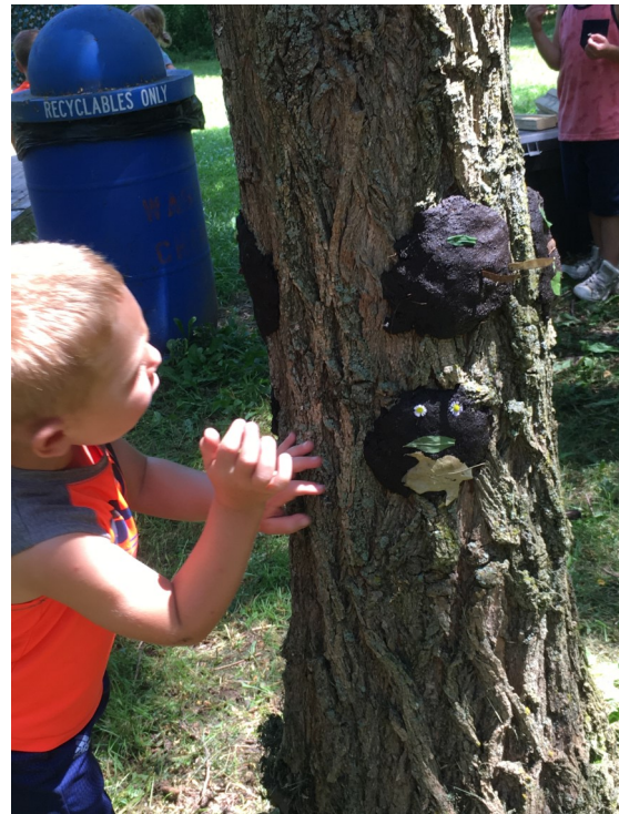
Making mudpie faces at Camp Y-Koda