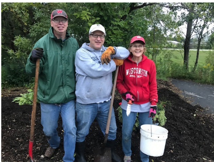
Mulching at the Sheboygan Falls Trailhead