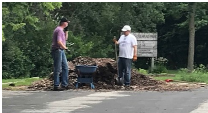
Shoveling mulch at the Erie Avenue Trailhead