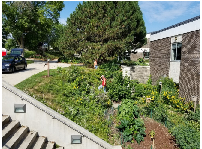
MGV's weeding Bird Cove on UW-GB Sheboygan Campus