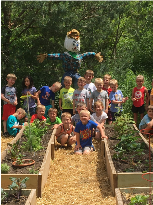
Raised bed vegetable gardens at Camp Y-Koda