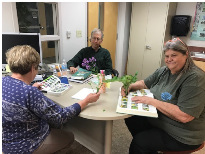
Answering questions at the Horticulture Hotline