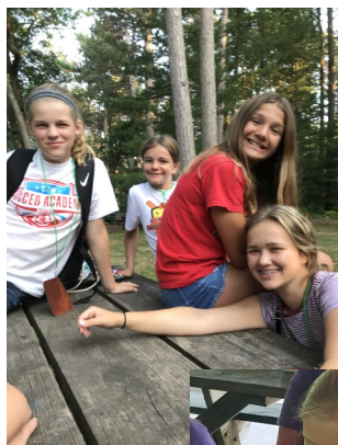
Girls just wanna and get to have fun at 4-H Summer Base Camp!

Don't miss this year's 4-H camping opportunities! We will be heading to Base Camp July 12-16, 2020 and Outpost Camp July 23-26; learning, friendship and fun are at the heart of both Sheboygan County 4-H Camps. Take a look at the brief descriptions below and decide which one best fits you. Parents, please register and send fees by the deadlines noted!