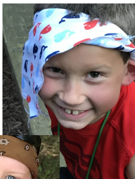
Where the boys come to play!

Details for camp (packing lists, health forms and behavior expectation forms) will be sent at about two weeks after the registration deadline. For more information on camp or 4-H in Sheboygan County, contact the Sheboygan County Extension Office at 459.5903.