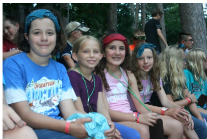
Make new friends but keep the old!

Details for camp (packing lists, health forms and behavior expectation forms) will be sent at about two weeks after the registration deadline. For more information on camp or 4-H in Sheboygan County, contact the Sheboygan County Extension Office at 459.5903.