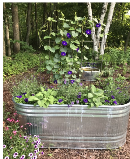
Lynn Thornton's garden.

MGV Level 1 Training - Tell your friends!!