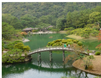
Ritsurin Koen Garden

All-Japan Tours really lived up to its name. They provided us with a wonderful itinerary, informative guide and careful driver. If you would like to see and hear more, I will be giving a travelogue at the Cedar Grove library, March 17 th at 1:00 pm.