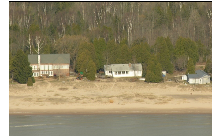
Most of this beach has disappeared due to high lake levels.