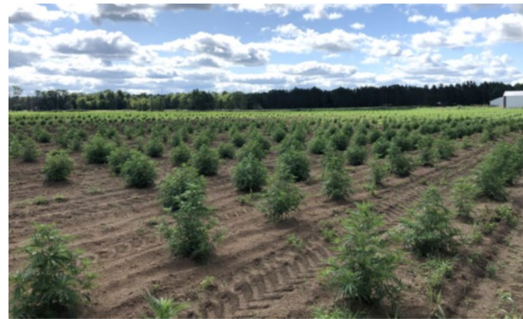
A field of industrial hemp for CBD production