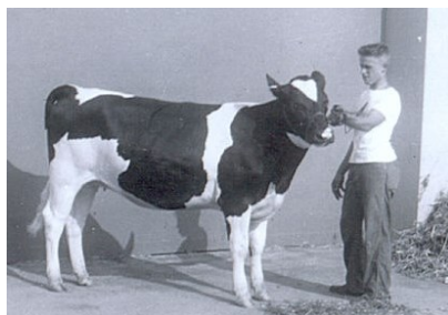
Figure 1: Can you name this 4-H Alumni from this 1948 State Fair photo?

Mark your calendars for Sheboygan Falls Winterfest on Saturday, February 11, 2023. *Note corrected Date* This annual event returns for another year to Rochester Park in Sheboygan Falls. The event begins at 2pm with sledding and ice skating (a limited number of ice skates are available to borrow). The heated shelter will be open and the Ourtown Orioles 4H club will be running a Hot Chocolate and Bake Sale fundraiser from 3-5pm. The final event of the day will be the Human Sled Dog Races starting at 5pm. Sign your team of Human Sled Dogs and a Driver up for the tournament.