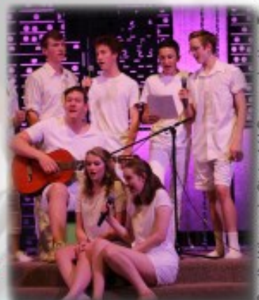
4-H Drama Company performing at 4-H & Youth Conference