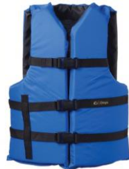
Adult Life Jacket