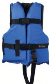
Child Life Jacket

The entire purchase of 140 PFDs will cost $2,450.