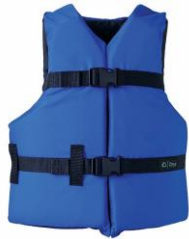
Youth Life Jacket