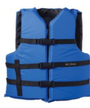
Adult Life Jacket