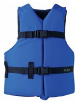
Youth Life Jacket