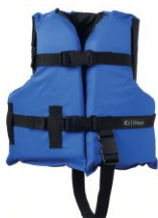
Child Life Jacket

The entire purchase of 140 PFDs will cost $2,450.