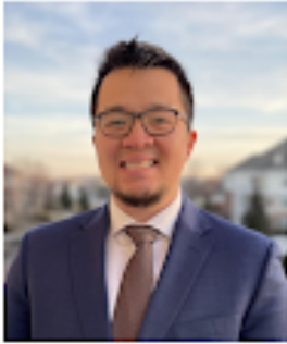
Human Development & Relationship Educator 920-459-5906 ext 5006 ttran23@wisc.edu